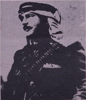
Abdul Qader al-Husseini

Qader went back to Jerusalem to work in the Land Survey Department. At that time the British authorities were confiscating Arab bare lands to give them to Zionist immigrants. Abdul Qader spent long nights pulling off trees from forested areas to plant them in bare lands for the British inspectors.