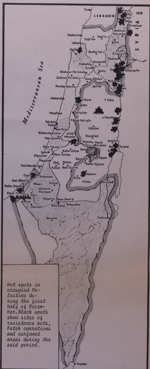
Hot spots in occupied Palestine during the first half of December. Black spots show sites of resistance acts, Fateh operations and curfewed areas during the said period.

DECEMBER 18: Mortar attacks on Degania Bet and Elyatsim settlements.