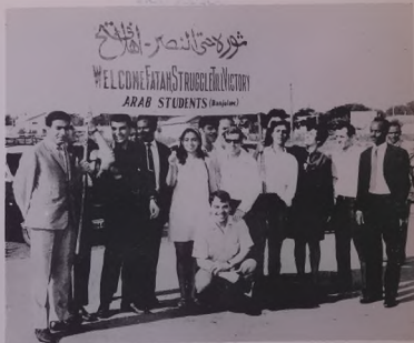
FATEH DELEGATION IS BACK FROM VISIT TO INDIA

A three-member Fatch delegation, including one woman, has just concluded a successful three-week visit to India on the invitation of the Indian Association for Afro-Asian Solidarity and the All India Peace Council.