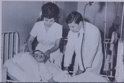
Iranian doctor specialising in children's health at work in Hacettepe Childrens Hospital at Ankara during his CENTO M.T.C.F. course.

The Multilateral Technical Cooperation Fund, along with other technical assistance programmes, thus makes a significant contribution to overall CENTO economic development plans. But apart from its specific contribution to the development of technical knowhow in the countries of Iran, Turkey and Pakistan, it provides an invaluable opportunity for CENTO regional neighbours to observe and understand, at first-hand, one another's cultures, custom and habits.